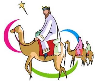
Our Lady of the Way 4-6 Laffers Rd Glenalta 5052