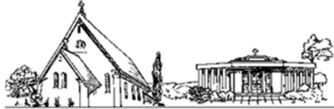
St Paul of the Cross cnr of Simla & Coromandel Pde Blackwood 5051